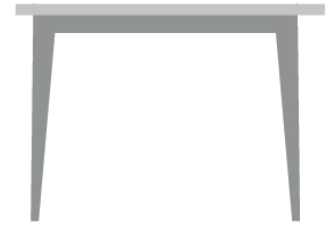
IMAGE AVAILABLE SOON

Table for indoor use with painted cast iron pedestal base table, 80 x 80 mm tube. Non-turn notch. Base of 40 x 40 cm. Table top in high pressure laminate (HPL).